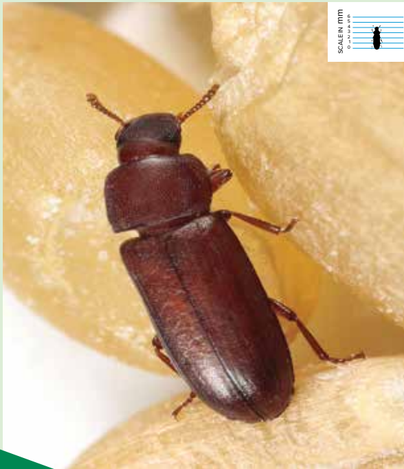
Rust-Red Flour Beetle ( Tribolium castaneum )