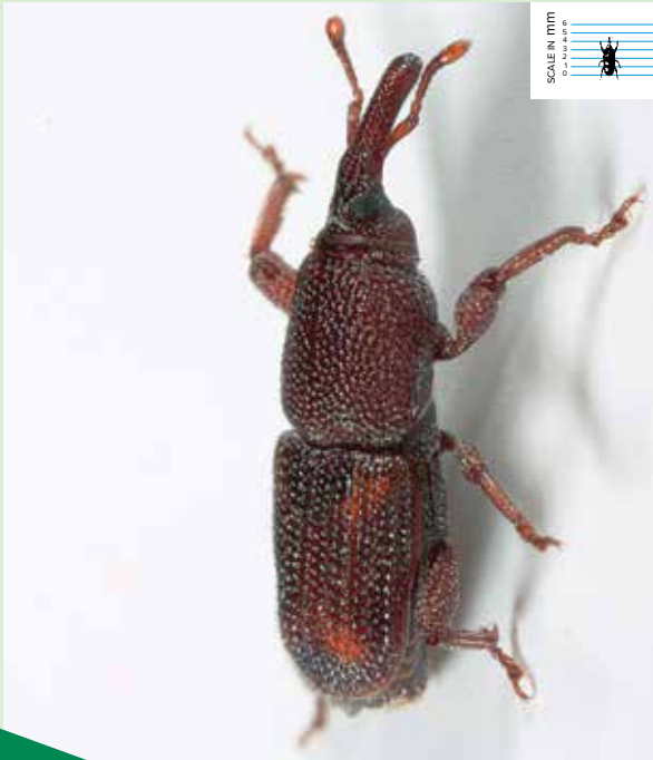
Rice Weevil ( Sitophilus oryzae )