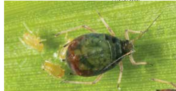
Wingless oat aphid