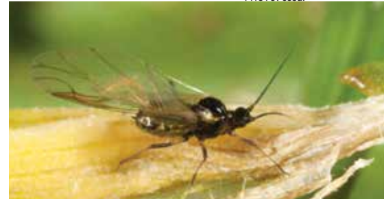
Winged oat aphid

but their greatest threat is as vectors of plant viruses. Many aphids can survive by taking refuge on plants within the green bridge over summer and autumn, some of which may be hosting viruses.