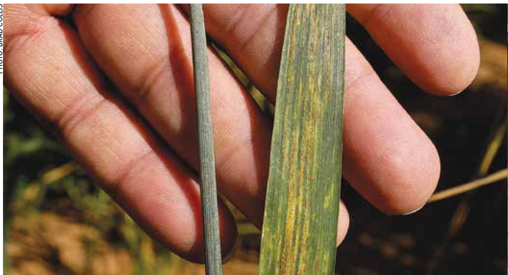
Uncontrolled stripe rust can cause serious crop losses in wheat and barley.