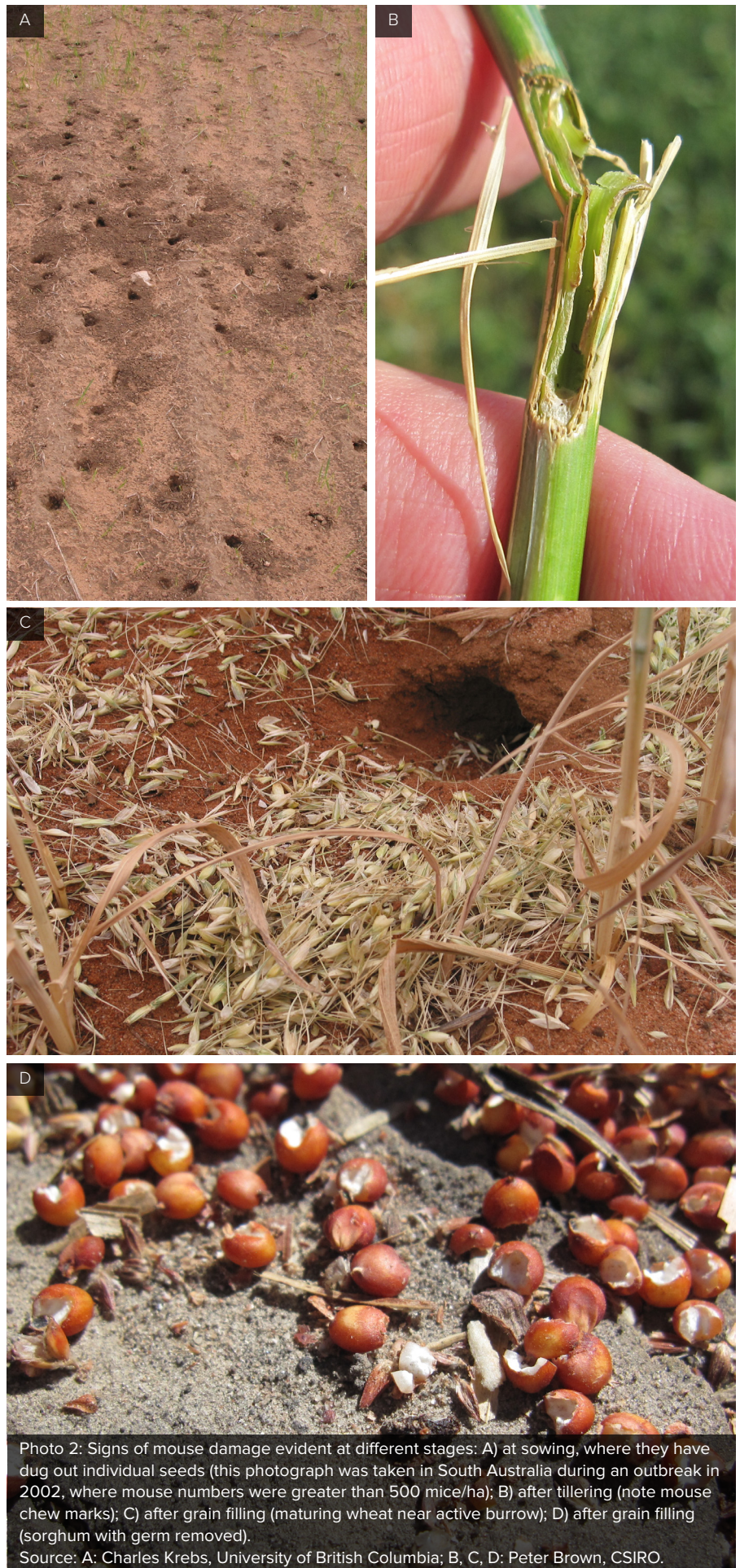
Photo 2: Signs of mouse damage evident at different stages: A) at sowing, where they have dug out individual seeds (this photograph was taken in South Australia during an outbreak in 2002, where mouse numbers were greater than 500 mice/ha); B) after tillering (note mouse chew marks); C) after grain filling (maturing wheat near active burrow); D) after grain filling (sorghum with germ removed).