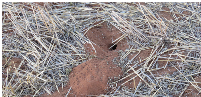
Photo 3: Signs of active mouse burrows in sandy and clay soils (note fresh footprints and fresh soil). Corn flour was used to mark potentially active burrows.