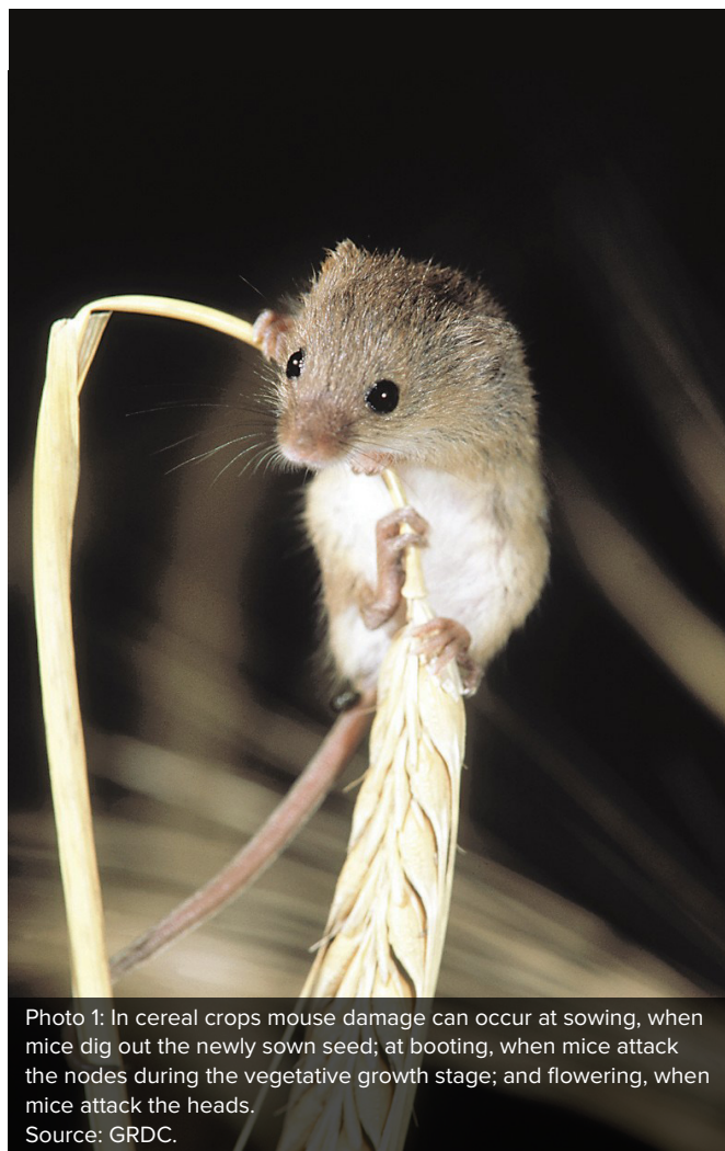
Photo 1: In cereal crops mouse damage can occur at sowing, when mice dig out the newly sown seed; at booting, when mice attack the nodes during the vegetative growth stage; and flowering, when mice attack the heads.

A mouse can eat 3.5 g/day so 30 kg/ha loss at harvest (for a yield of 1 t/ha) is equivalent to 8570 mouse grazing days/ha.