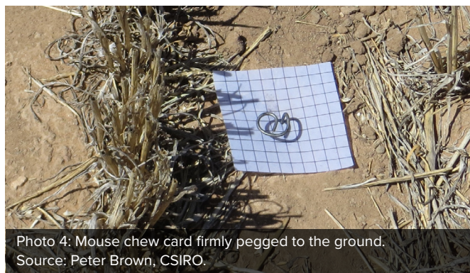
Photo 4: Mouse chew card firmly pegged to the ground.