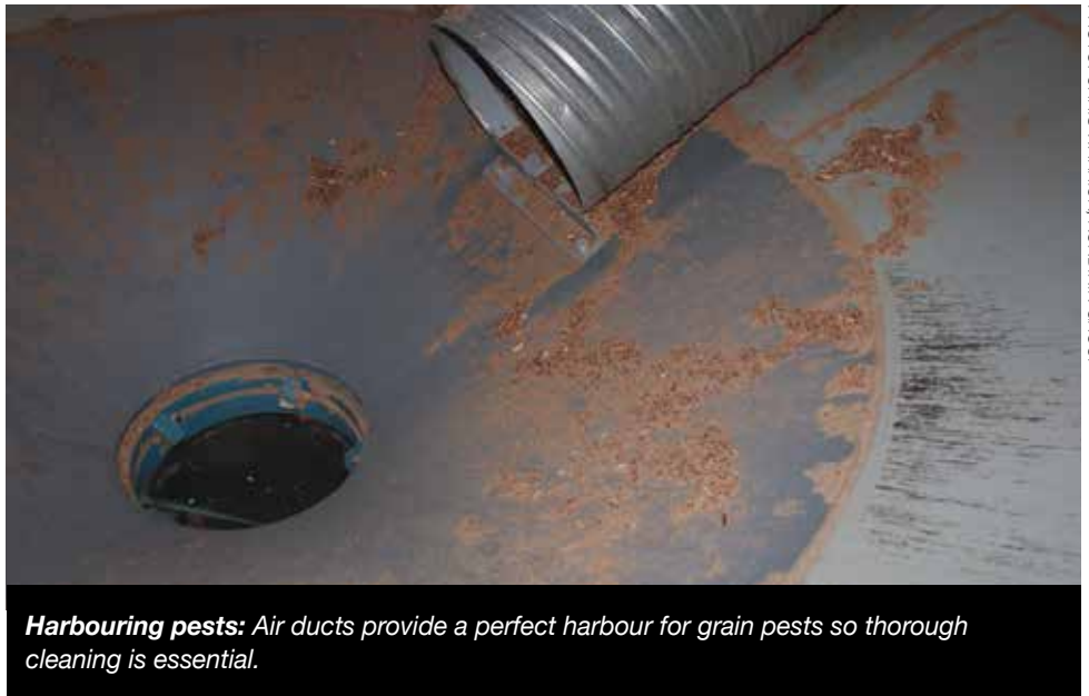
Harbouring pests: Air ducts provide a perfect harbour for grain pests so thorough cleaning is essential.

Calculation of surface areas of machinery is not normally possible.