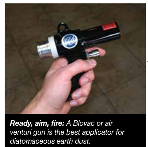
Ready, aim, fire: A Blovac or air venturi gun is the best applicator for diatomaceous earth dust.