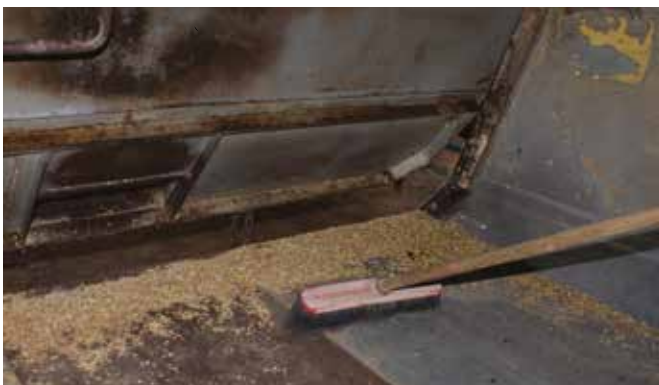
Trucks: Grain left in trucks is an ideal harbour for grain pests to breed. Keep trucks, field bins and chaser bins clean.