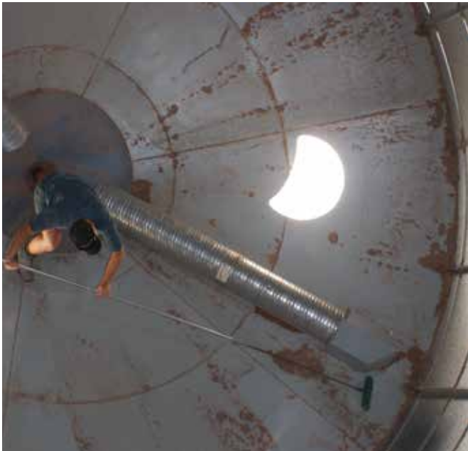
Silo sweep-out: An extended broom handle makes sweeping out silos easier.

While most grain buyers accept small amounts of residue on cereal grains from chemical structural treatments, avoid using them or wash the storage out before storing oilseeds and pulses.