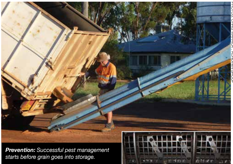
Prevention: Successful pest management starts before grain goes into storage.

Grain pests live in dark, sheltered areas and breed best in warm conditions.