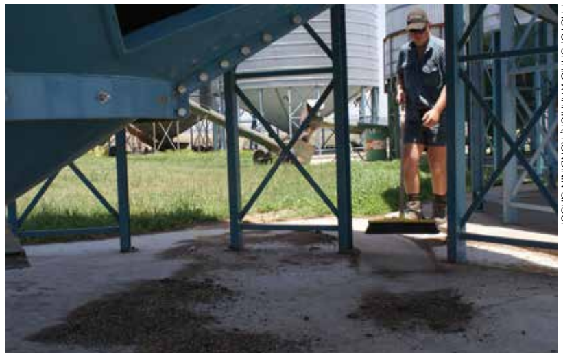
A clean site: A concrete slab under silos makes cleaning easier.