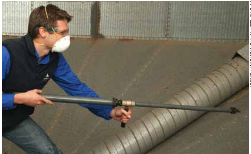
All-over clean: Clean silos, including the silo wall, with air or water to provide a residue-free surface to apply structural treatments.