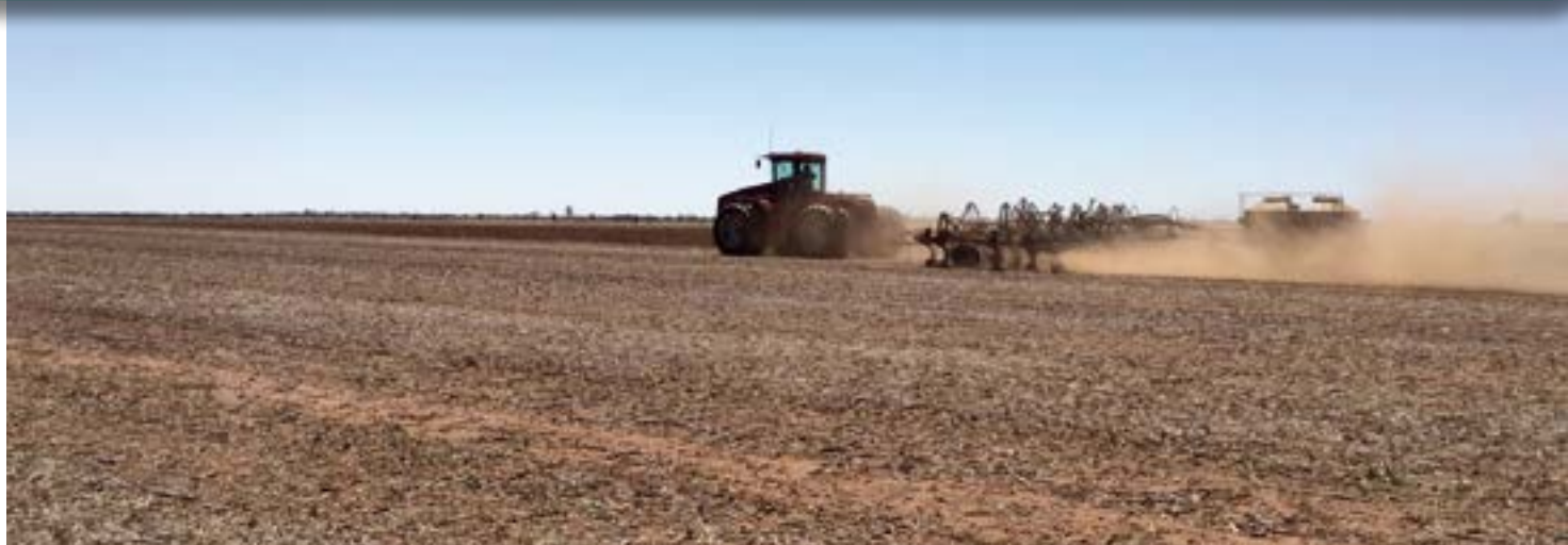
Early sowing of EGA Wedgetail ® at Quambatook, north-east of Birchip, on March 9, 2014.