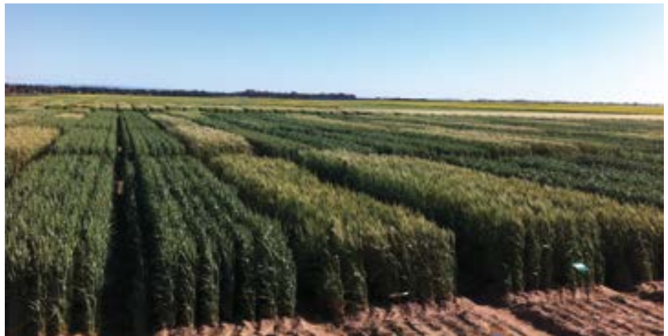
These wheat plots show the differences in maturity of varieties grown in trials at Inverleigh, Victoria, in 2013. The plots were all sown on May 10 but maturity ranged from GS 51 to GS 71 in October.

In the past 17 years, the number of dry autumns has increased, providing a new challenge for growers to manage the sowing time of wheat. A balance must be obtained between wheat flowering too early and risking frost damage, and flowering too late and risking drought and heat damage. While growers may understand when the optimal flowering time falls during the season, deciding when to sow is more difficult if season-breaking rainfall comes later than in previous years.