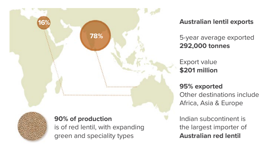
Figure 1: Australian lentil production and exports.

Australia's lentil industry has benefited from the release of ever-improving varieties, which offer wider adaption, improved agronomic features, plant physiology, plant architecture and yield. These varieties, along with improved crop-management techniques, provide growers with the confidence to grow this high-value crop.