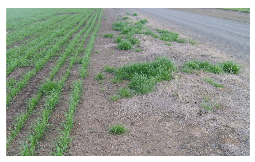
Figure 2: Glyphosate resistant annual ryegrass on the Liverpool Plains, NSW.