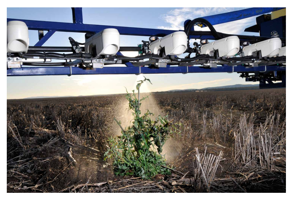
Figure 5: Selective sprayer technologies use optical sensors to turn on spray nozzles only when green weeds are detected.