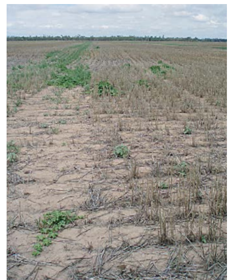
Figure 2: Typical of a higher clearance sprayer in a cross-wind situation.

If using a 50-centimetre nozzle spacing, it may be worth considering using narrower nozzle spacings (25cm) behind and adjacent to the wheels to