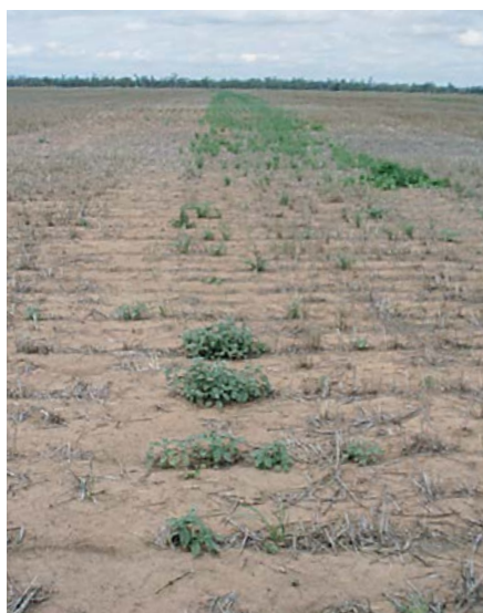
Figure 3: Typical of a low clearance trailing sprayer in a head wind situation.

Front-mounted booms can provide improved deposition in and adjacent to the wheel tracks, provided speed is not excessive. At higher speeds (typically above 25km/h), the air displaced forwards by the front tyres can push droplets away from the wheel track. The issues of plant stress, dust and