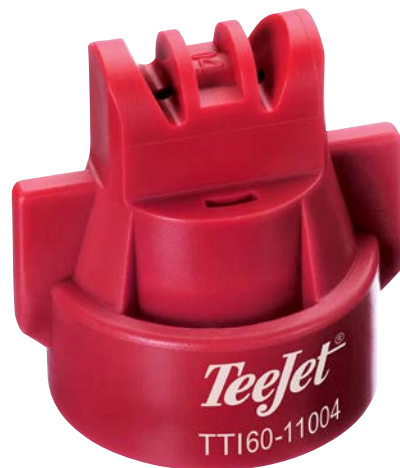
Figure 1: Switching tips behind the wheel to an O4 (red) when the rest of the boom is fitted with O2 (yellow) tips will double the application rate in the wheel track.

Mudguards and mudflaps by themselves are not likely to solve the problem of poor deposition of spray in and around the wheel tracks. They should be used in combination with wheel-track nozzles and the other factors discussed in this Fact Sheet.