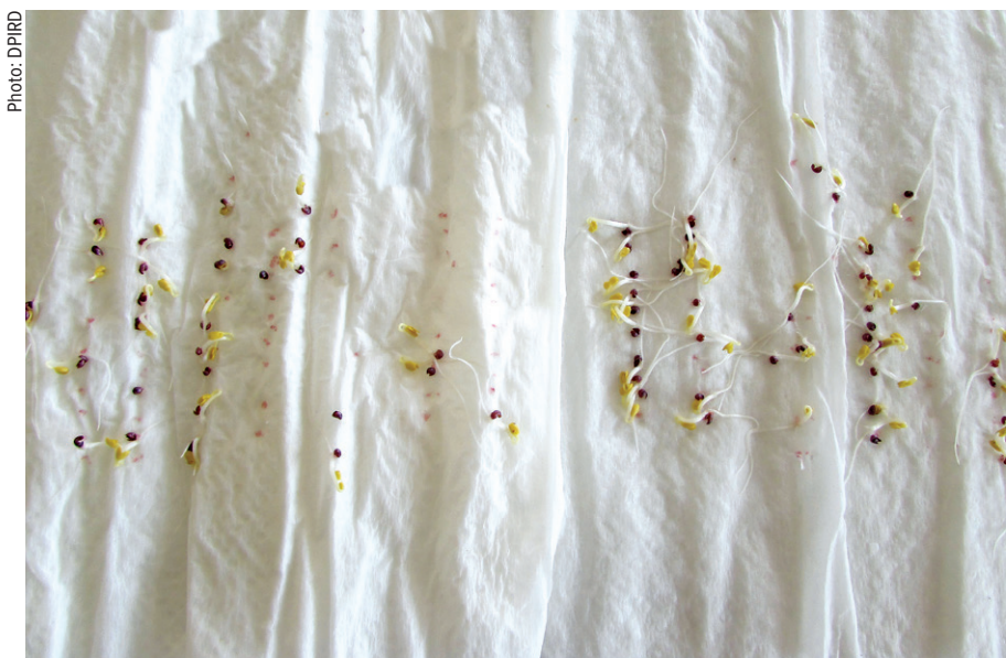
Canola seed germination test showing after seven to 10 days viable seeds emerging.