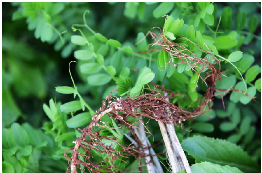
Photo 1: Vetch roots showing an adequate level of nodulation for good nitrogen fixation. Vetch can fix between 50 and 150 kg N/ha depending on end use. No differences in nitrogen fixation have been recorded between vetch varieties. Nitrogen fixation is directly correlated to biomass production.

When assessing the effectiveness of nodulation, the more nodules and the earlier the infection (i.e. on the tap and crown roots) the better. Nodules need to be pink to be effective.