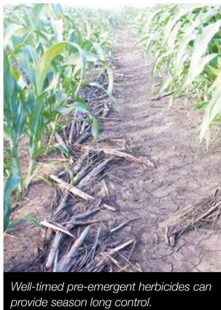
Well-timed pre-emergent herbicides can provide season long control.

To understand how pre-emergent herbicides will perform, it is important to understand the properties of the molecule and the soil type and how they interact and are broken down in the environment.