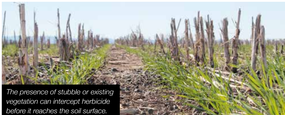
The presence of stubble or existing vegetation can intercept herbicide before it reaches the soil surface.

With the continued evolution of herbicide resistance, growers are being forced to introduce a range of different weed control tactics. A tactic that has rapidly increased in recent seasons is the use of pre-emergent herbicides, especially in the summer crop and fallow. To predict field performance of these herbicides, an understanding is needed of their chemical properties and how they interact with the environment.