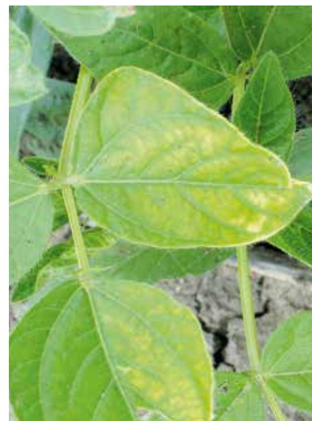
Waterlogging in combination with pre-emergent herbicides may sometimes result in crop injury.

Careful attention to planting set up is required to ensure seed is placed in the area without herbicide and treated soil is not thrown into adjoining crop rows. Press wheels are generally required to ensure treated soil does not fall back into the furrow. Heavy rainfall after application can still cause problems if treated soil is washed into the furrow.