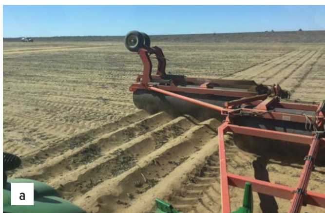
Figure 5: Rollers range from (a) flat steel rollers to (b) rollers mounted on deep ripping machines. Note the reduction in standing stubble following ripping and rolling in Figure 5b.

A range of rollers of varying designs are being used commercially (Figure 5). The ideal roller for individual situations will depend on soil type, the degree of topsoil consolidation and levelling required, the size and number of clods, erosion risk and the surface finish required for crop establishment. More information on roller types and suitability for various situations can be found here .