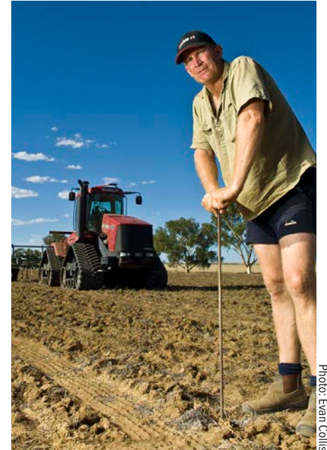
Figure 3: Push probes and cone penetrometers can be used to identify layers of high soil strength and to assess subsoil fracturing and loosening after ripping.

In clay soils, compacted layers often have a distinct upper and lower boundary with large clods that have a platy (horizontal) shape and large appearance. In poorly structured cracking clays, clod faces are dull rather than shiny. The soil may feel puggy when wet and clods will tear apart like raw pastry. When dry, clods are not friable; they break where you apply force rather than parting along natural fracture faces. If soil is dispersive, small clods placed in distilled water or rainwater will disperse without the need to shake them, and the water will turn cloudy within an hour.