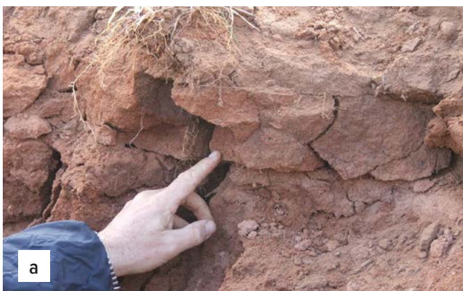
Figure 4: (a) A distinct compacted layer in a sandy loam. Note fractures in hardpan through which roots preferentially grow. (b) Massive unstructured soil between three rip lines, compared with the aggregated soil on the deep ripping breakout.

Deep ripping strips across varying soil types and depths can provide a useful indication of likely yield responses