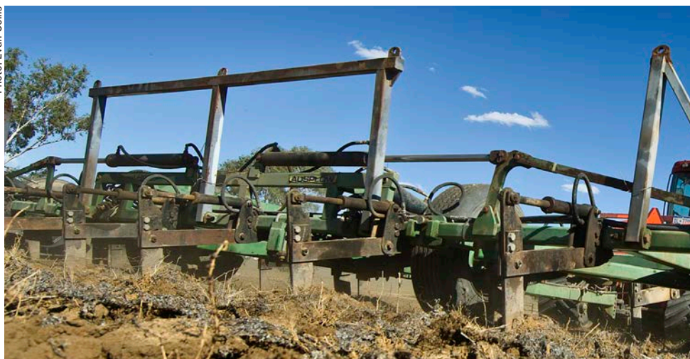
Some growers use deep ripping to ameliorate soil constraints that otherwise restrict the uptake of moisture.