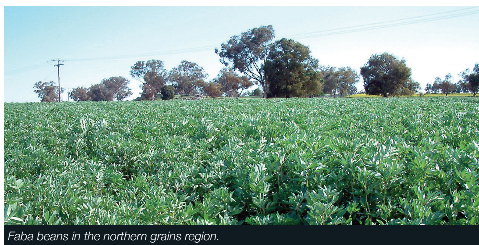
Faba beans in the northern grains region.