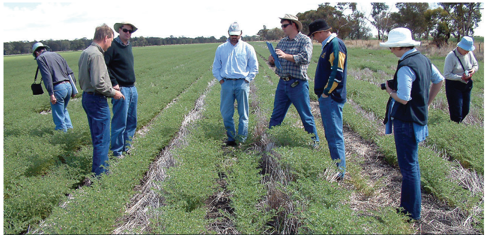
Inspecting a well-managed crop of chickpeas near Gurley in northern NSW.

legumes add to the N of the soil, from where it can be used by following non-leguminous crops such as cereals and oilseeds.