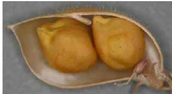
Photo 4: Full maturity, known as 'rattle pod', where the seed has detached from the pod wall and will rattle when shaken.

To avoid the need to inspect seeds, desiccate when 80–85% of pods within the crop have turned yellow-brown (Photo 4). This is usually too late for the control of ryegrass survivors. 5