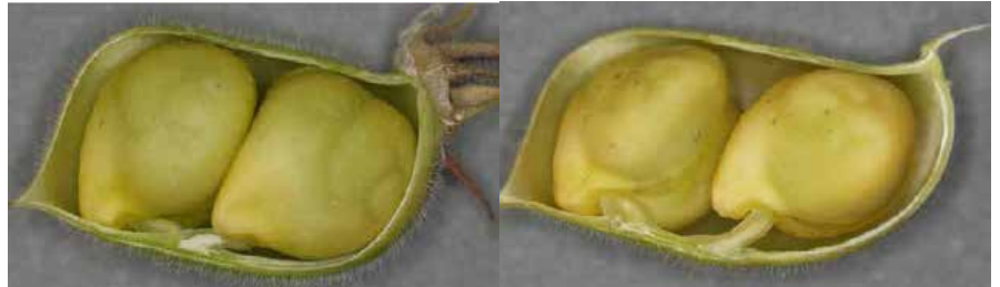
Photo 3: LEFT: Pods in the top 25% of the canopy should mainly be in the final stages of grainfill, where the yellow colouring is moving from the 'beak' down through the seed. RIGHT: The bottom 75% of pods should have reach maturity. Seeds have turned yellow and the pod has been bleached to a very light green-yellow.

Seeds are considered to be physiologically mature when the green seed colour begins to lighten. The Western Australian recommendation of physiological maturity is 'when the pod wall begins to yellow' (Photo 3, right).