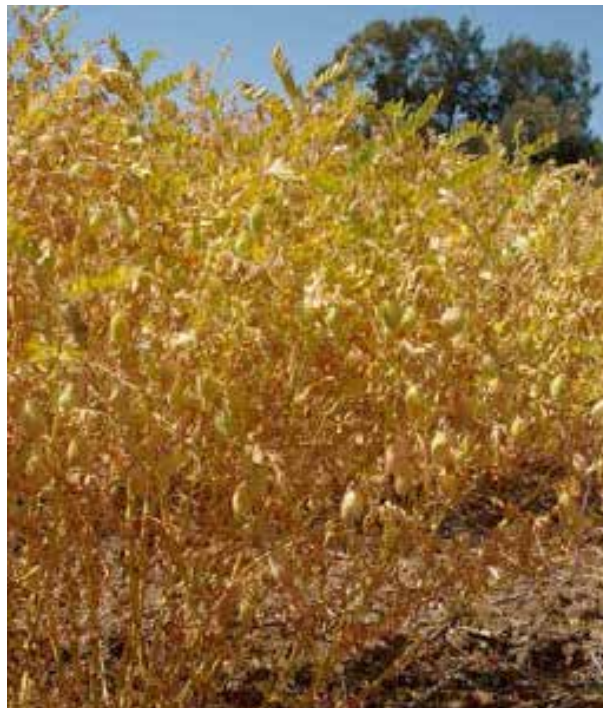
Photo 2: Correct desiccation timing based on inspection of uppermost pods of each fruiting branch.

Careful monitoring is needed to determine the correct timing for desiccation in both chickpea species. Yield reductions of 10–20% can occur if applied too early. Quality can also be adversely affected. The optimal stage to desiccate chickpea is when the vast majority of seeds have reached physiological maturity i.e. 90–95% of the crop. Inspect the seeds within the uppermost 20% of pods on each main fruiting branch (Photo 2).