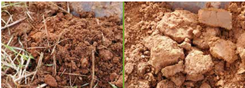
The block clods of the compacted layer following ripping (right) compared to the small friable aggregates in an uncompacted soil (left).

Ripping at the break conflicts with lupin seeding or with early sowing of wheat. Delaying wheat or lupin planting can reduce yields. However, this must be weighed against potential yield advantages from ripping, including its residual value.