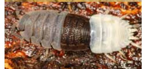
There are a number of slater species in Australia including (from top) Flood bug slater ( A. bifrons ); Common slater ( Porcellio scaber ) and the Pill bug slater ( Armadillidium vulgare ). When moulting, slaters shed in two stages – the top half of their body first followed by the remaining half two days later (above).

colour with darker irregular spots and a dark brown stripe down the middle of its back. It is a low-land swampy soil species adapted to marshy environments. Areas worst-affected in the past by A. bifrons are prone to flooding.