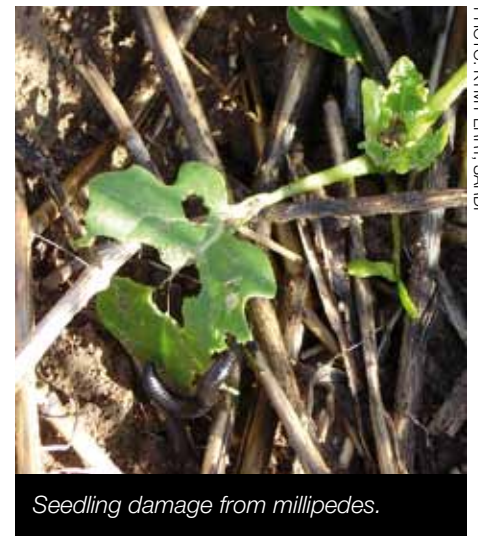
Seedling damage from millipedes.