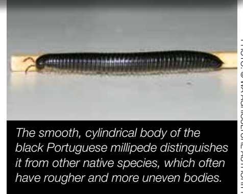
The smooth, cylindrical body of the black Portuguese millipede distinguishes it from other native species, which often have rougher and more uneven bodies.

In canola, millipedes remove irregular sections from the leaves and can kill whole plants if damage is severe. Damage to cereals can also occur where the stems of young plants are chewed.