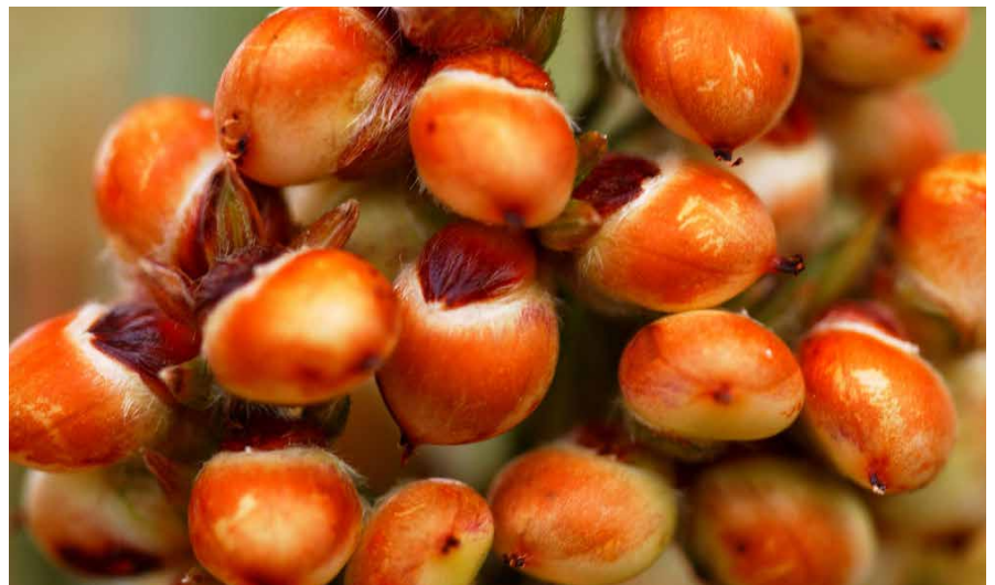
Figure 2: Ripe sorghum grain.

If using desiccation, this is the optimum time to apply a registered herbicide to kill the plant, preventing additional moisture use. 13