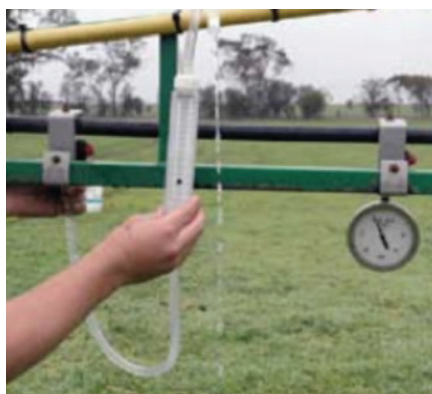
Test controller settings and nozzle performance well before cropping starts.

There is a need to increase application volumes to 70 to 100L/ha or more where high stubble loadings, dense crop canopies or the use of spray qualities larger than coarse (very coarse, extremely coarse or ultra-coarse) result in reduced coverage. Always check product labels and the manufacturer's technical information for specific advice about appropriate application volumes and timing in relation to a crop's growth stage.