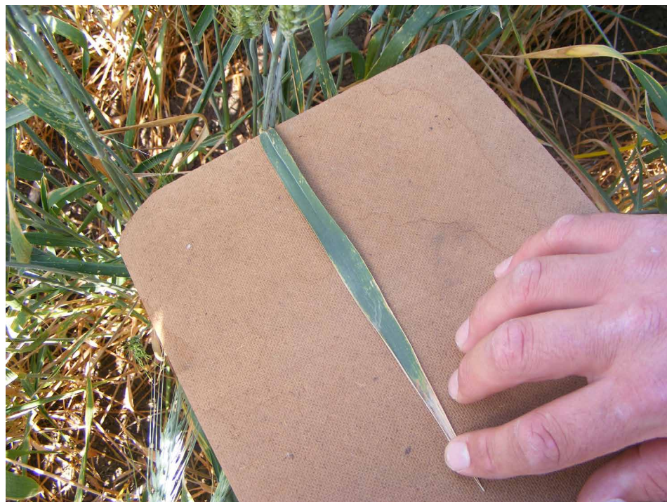
Figure 3: Flag leaf.

The answer to the question posed was that where stripe rust infection occurred at second node (GS32), the two-spray program was optimal, but with a later flag-leaf infection, there was no advantage to applying fungicide twice. It is arguable that since fungicides are insurance inputs, the more consistent program of the two trials (in terms of disease control and yield response) was fungicide applied at both second node stage GS32 and at flag-leaf stage GS39.