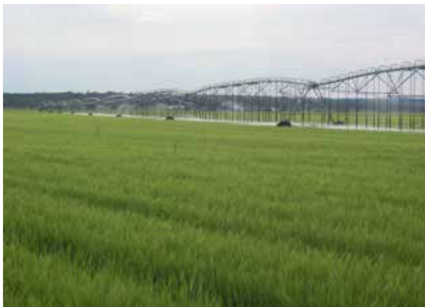
Figure 2: Wheat under irrigation.

was associated with increased lodging. Maximum yields for irrigated experiments were generally achieved when soil + fertiliser N at sowing was <math><100\text{ kg/ha}</math>, with low-N treatments having less lodging and yield increases of up to 1 t/ha compared with high N treatments. Increasing plant density to >100 plants/m 2 increased lodging and decreased yield in high-N treatments. The highest yielding treatments had the least lodging, a harvest index of 0.45, and <math><450\text{ tillers/m}^2</math> at the end of tillering. Therefore, canopy-management techniques can be used to increase yields and decrease lodging in irrigated wheat in the northern region, but the techniques will be different from those used for irrigated wheat growing in southern Australia. The responses observed may have been reliant on irrigation during tillering to ensure that low levels of N were fully available to the crop. Further study is needed to determine the importance of early-season irrigation in maintaining yield on low-N paddocks. 8