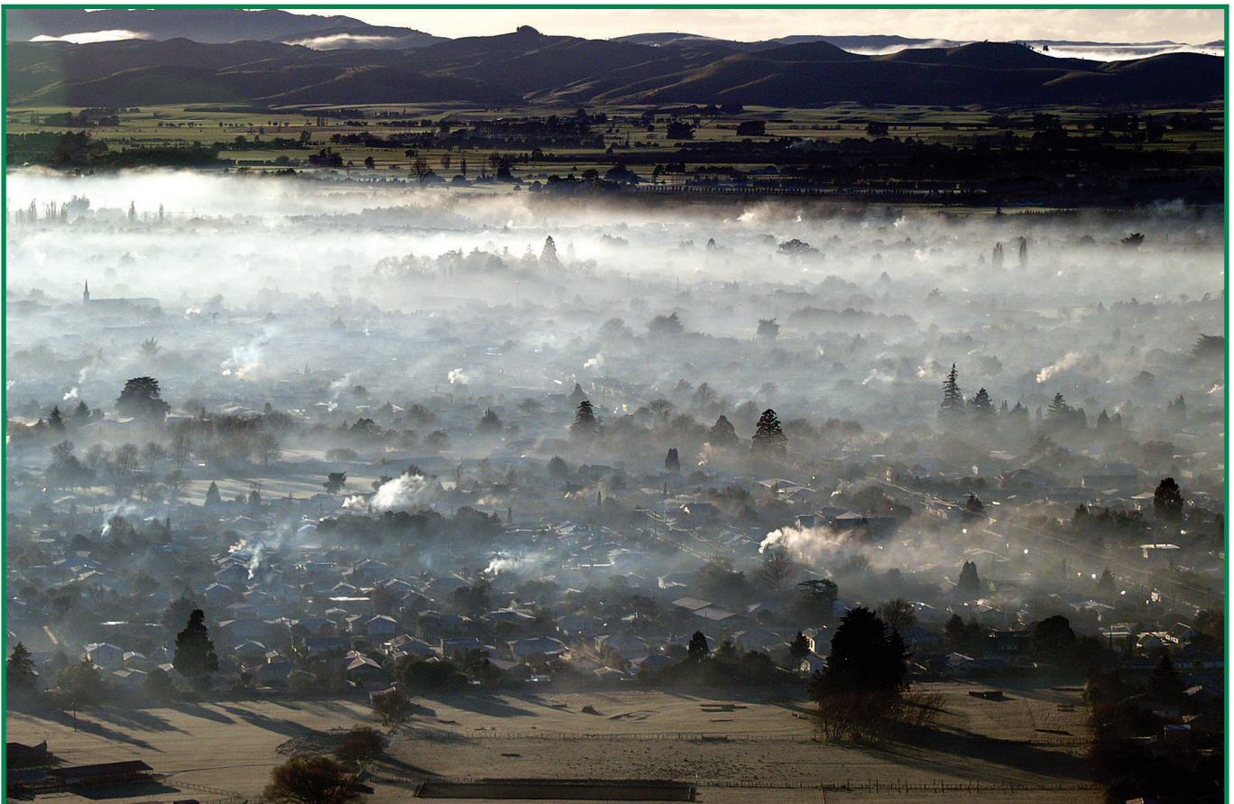
Figure 2: Smoke plumes fumigate to the surface and combine within cool-air drainage within hazardous inversion conditions. The smoke motion and concentration mimics that of invisible pesticides drifting in similar condition.