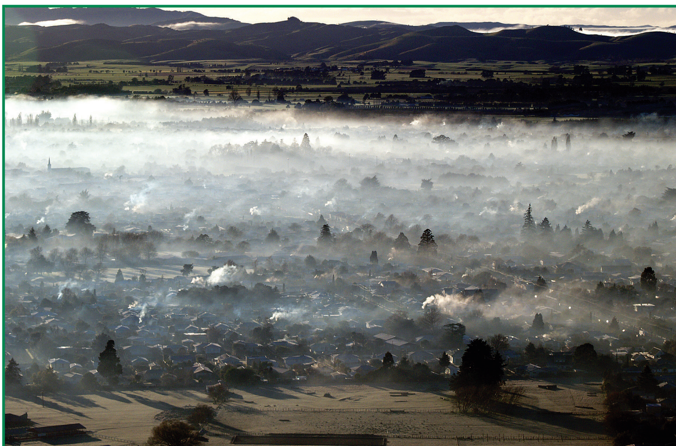
Figure 2: Smoke plumes fumigate to the surface and combine within cool-air drainage within hazardous inversion conditions. The smoke motion and concentration mimics that of invisible pesticides drifting in similar condition.