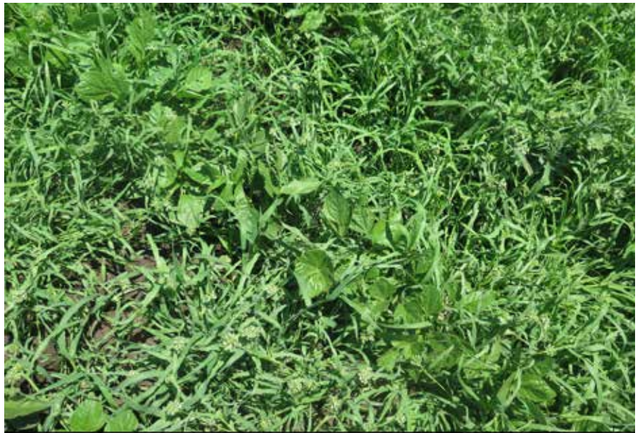
Photo 3: Button grass growing in a mung bean crop in Qld.