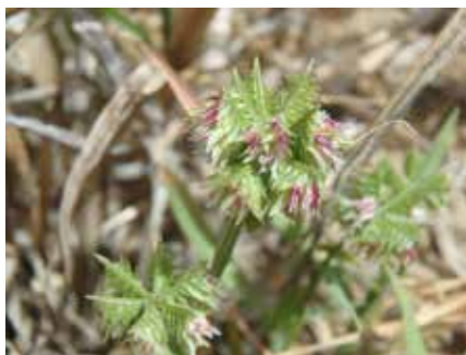
Photo 5: Button grass seed heads.