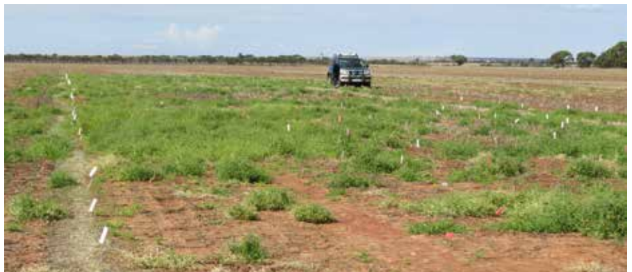
Photo 2: Button grass dominating the summer fallow, at Mullewa WA.

Where this species grows in crop, the registered selective herbicides should be used on seedling button grass plants, before the weed causes significant yield loss.