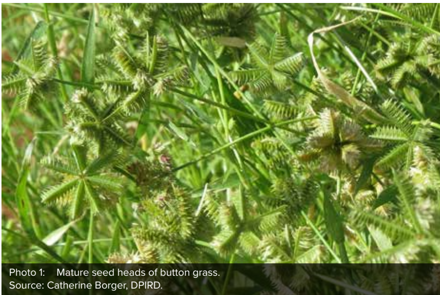
Photo 1: Mature seed heads of button grass.

Button grass ( Dactyloctenium radulans , Photo 1) is one of a number of summer weeds identified by growers as a potential emerging threat due to changing growing conditions. Button grass can reduce yields and be toxic to livestock.