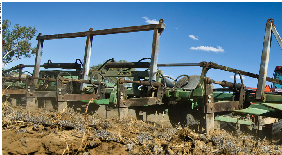
Some growers use deep ripping to ameliorate soil constraints that otherwise restrict the uptake of moisture.