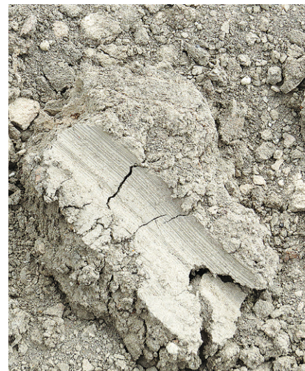
Figure 4: Deep ripping when soil is too wet causes smearing of clay soils.