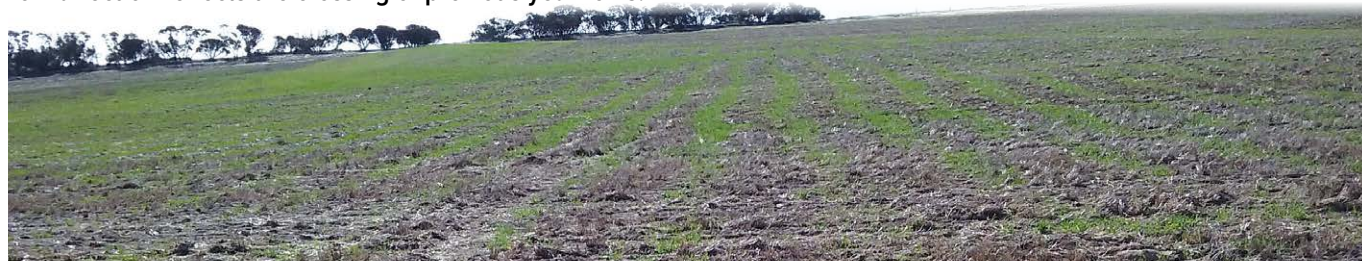
Figure 3: Angled-row sowing: Banded pattern of crop establishment from sowing at a 10° angle to the stubble row direction reflects the crossing of previous year rows.